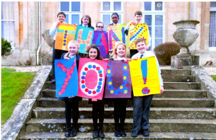
Some of Mary Hare's Year 7 pupils